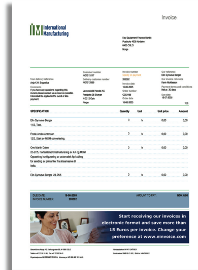
“After” StreamStudio Composer sample with Marketing Message